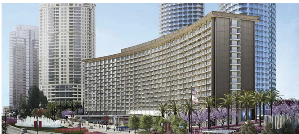
The $2.5-billion Century Plaza Redevelopment in Century City is the second-largest project to break ground in 2016.